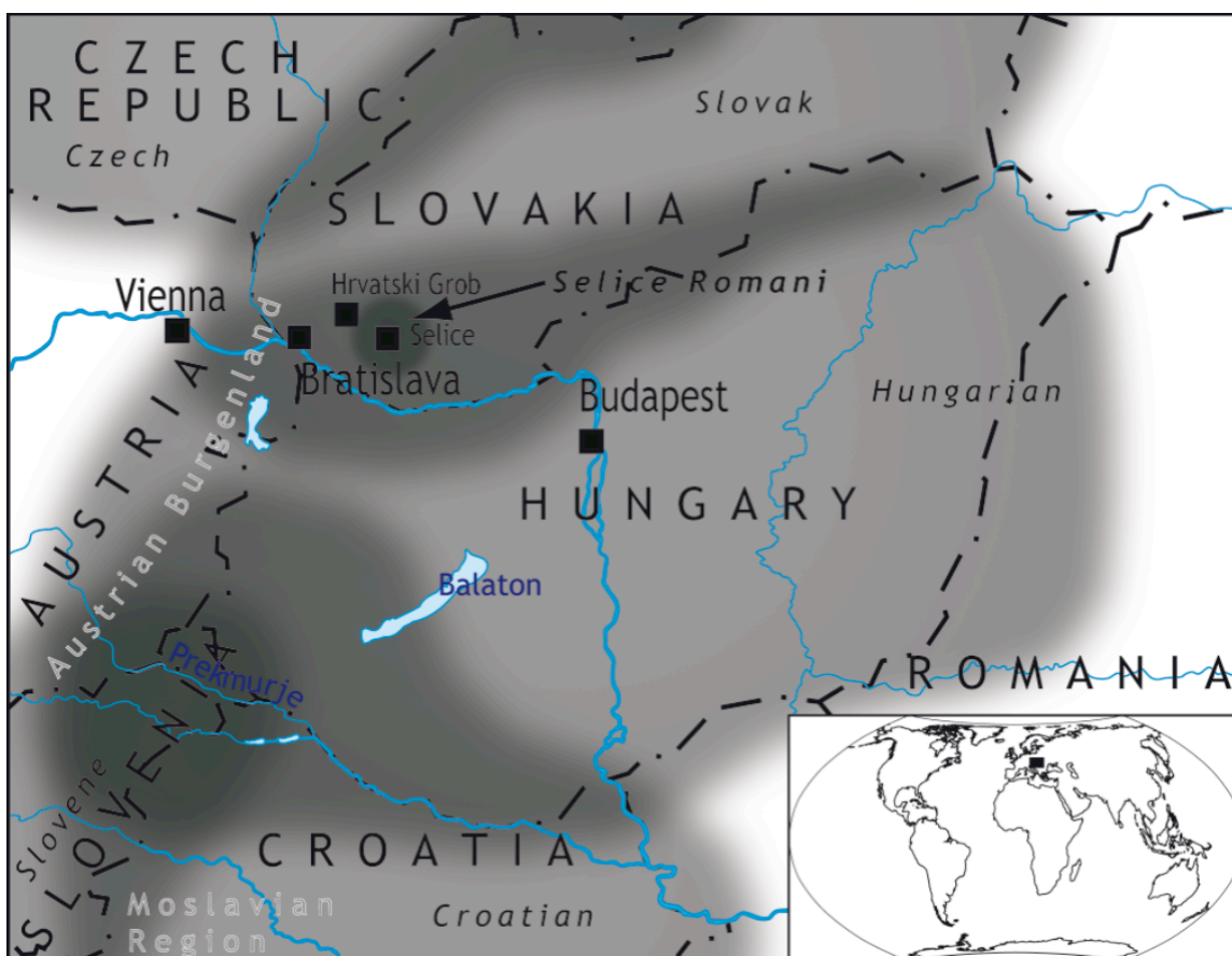
Map 1: Geographical setting of Selice Romani

language in Slovakia, there is no recognition of the Rumungro dialect specifically and, so far, there have been no attempts at its standardization. While all Hungarian Roms of Selice born before 1975 or so are native speakers of Selice Romani, in some families children are presently spoken to only in Hungarian and/or Slovak, and left to acquire some competence in Romani in adolescent and adult peer groups, if at all. Thus, Selice Romani is not a safe language, though it is not seriously endangered yet. Interestingly, many Hungarian villagers understand Selice Romani well, although only a few have some active competence in it and I know of no fluent speakers. (See §3.7 for more details on the current contact situation.)